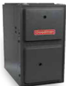
GMSS96 Gas Furnace

Overall Rating: 4.8 out of 5 Number of Ratings: 1,216